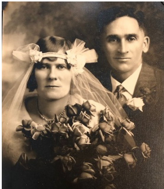
BAKKO - DALEN